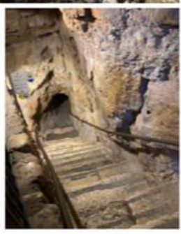
Church of St. Peter - Outside is a statue depicting Peter's denial of Christ before the cock crows 3 times, An original roadway where Jesus may have walked, and a plaque along with the church.