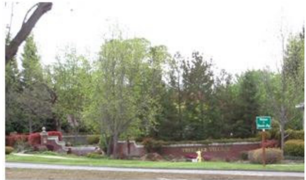
Scenic East Roseville Parkway in Granite Bay

Granite Bay is a beautiful area with rolling hills, a rural feeling, and wide scenic parkways, walkways, and corridors that are beautifully landscaped with lush forests, streams, and lakes.