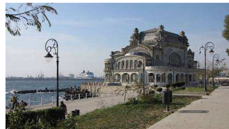
The Casino in Constanta

Our next port was Constanta, Romania. The old Casino is the most picturesque building that is used for promoting the city. It is right on the Black Sea. Ovidiu's Square contains the statue of the Roman poet, Ovidius Publius Naso.