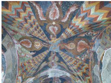
Fresco in Sophia Mosque

Sinop was also a quaint walled city. They honor their native born philosopher, Diogenes who died in 323 BC.