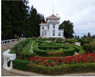
President Ataturk's Home in Trabzon

Republic of Turkey. Hagia Sophia Church is also located in Trabzon. It had some very impressive Frescoes.