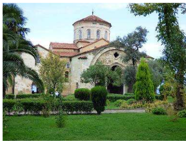
Sophia Mosque in Trabzon