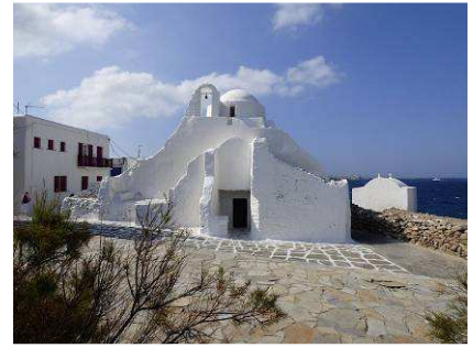
A Church in Mykonos

Our next port was Mykonos, Greece. This was near the top of my favorite stops. The city is white with narrow streets and shops. It reminded me a bit of Carmel, CA. The old windmills here are quite the attraction.