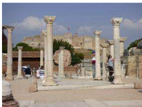
The Tomb of St John in the Church of St. John