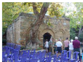
The home of St. Mary

Then a final return to Istanbul for our flight back to CA.