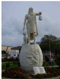
Statue of Diogenes

Sinop was also a quaint walled city. They honor their native born philosopher, Diogenes who died in 323 BC.