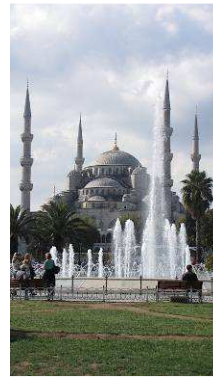
The Blue Mosque

Turkey appears to have an abundance of stray cats. Most of them want a little attention. Highlighted sites included The Blue Mosque with the foot-washing stations before entering, and Sophia's Mosque. We also visited the Roman Cistern, Topkapi Palace, and Rumeli Fort.