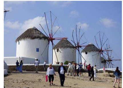
The Windmills in Mykonos

From Mykonos some of us took a ferry ride to the island of Delos where the most mythological, historical and archaeological ruins in Greece are located.